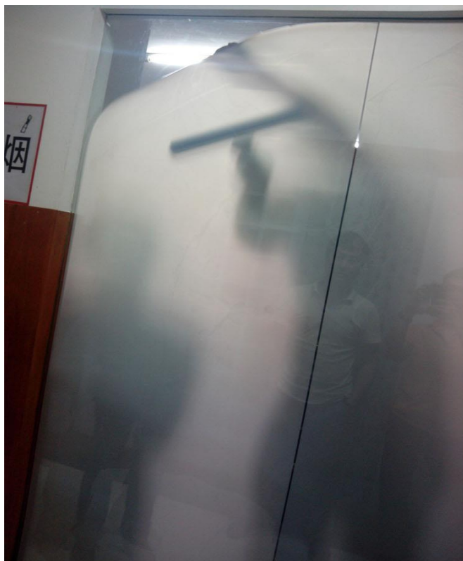
Photo in Installation